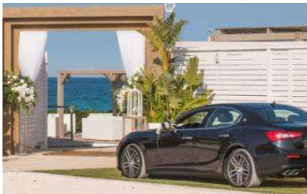
FRONT ROW OR VALET PARKING